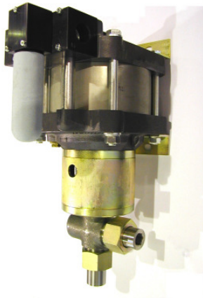
GSF25 (L) single acting, single air drive head with di- stance piece (Standard= Bottom inlet)